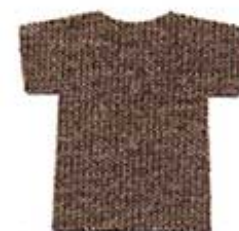
Heather Dark Chocolate-174H