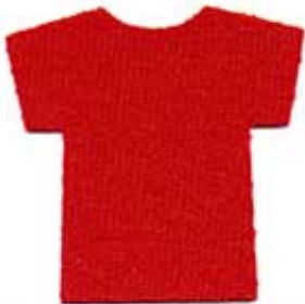
Cherry Red- 194C